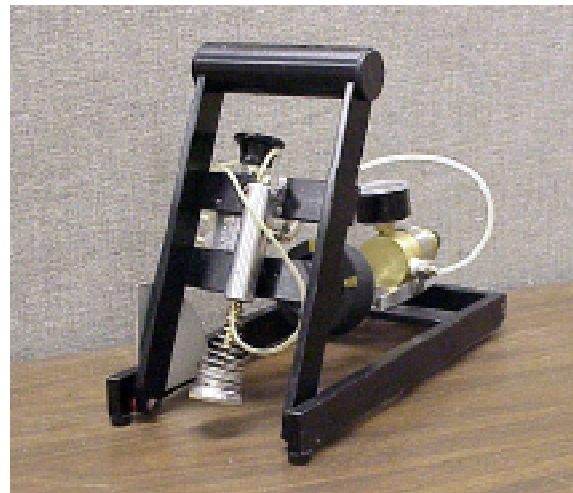
Figure 3. English XL (VIT) 7